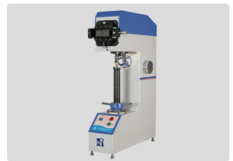
Hardness Testing Machine