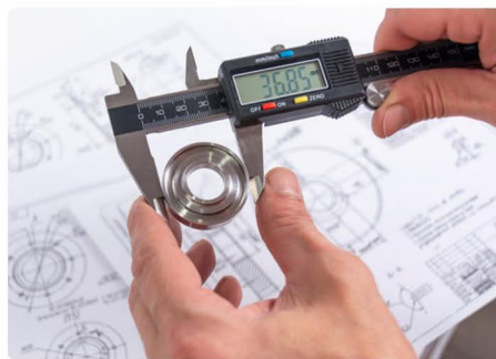
Vernier / Caliper